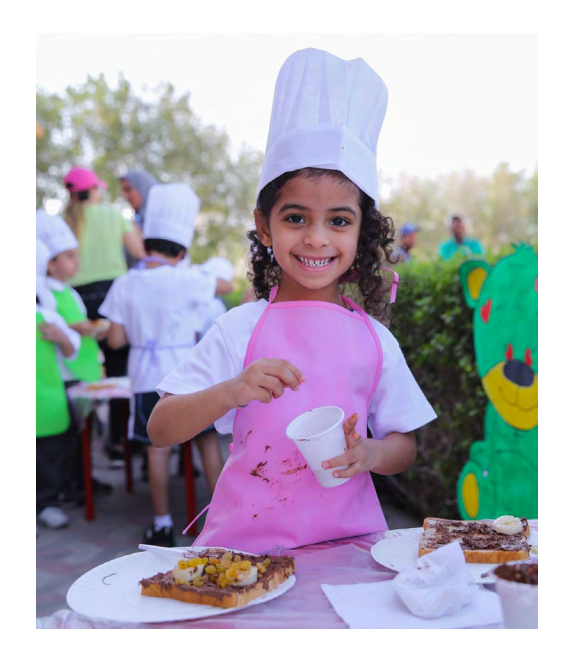
Teddy bears are that common souvenir of childhood